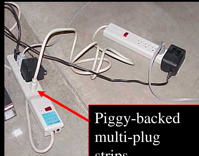
Piggy-backed multi-plug strips