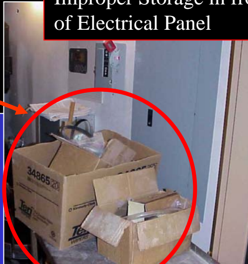
Improper Storage in front of Electrical Panel